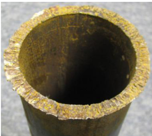
2.375" 4.7# P-110 Cut Laying Low Side in 4.5" L-80 Casing

More sizes available for heavy weight tubulars / drillpipe