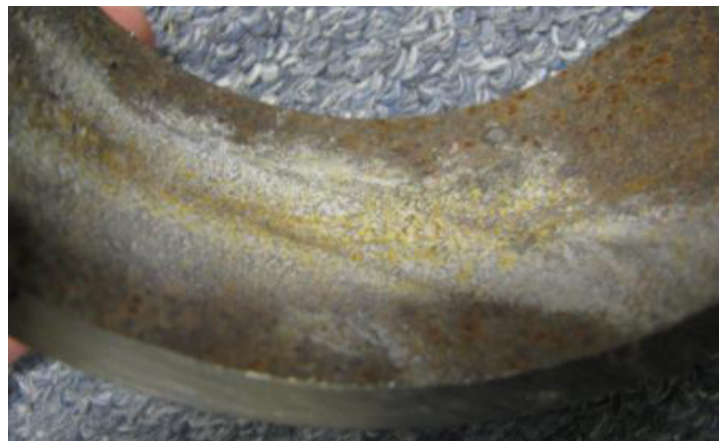
4.5" L-80 Casing Witness Results - no overpenetration observed.